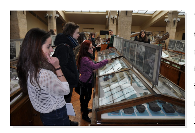
Day 5 – University day

and after that, we went back to the school where we watched some presentations about Sofia river Perlovka and water areas in Bulgaria. We had free time after that.